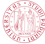
UNIVERSITÀ DEGLI STUDI DI PADOVA